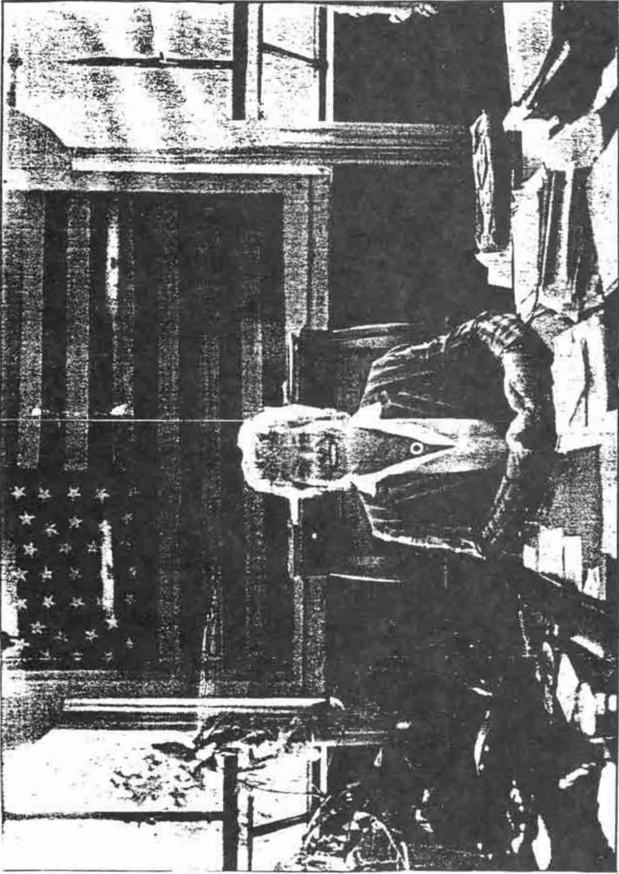
ARM TWISTING — Secretary of State Norma Paulus was instrumental in urging the first national Conference of Women State Legislators 10 years ago when she was a member of the Oregon Legislature. "rip into the 'dark ages.'"